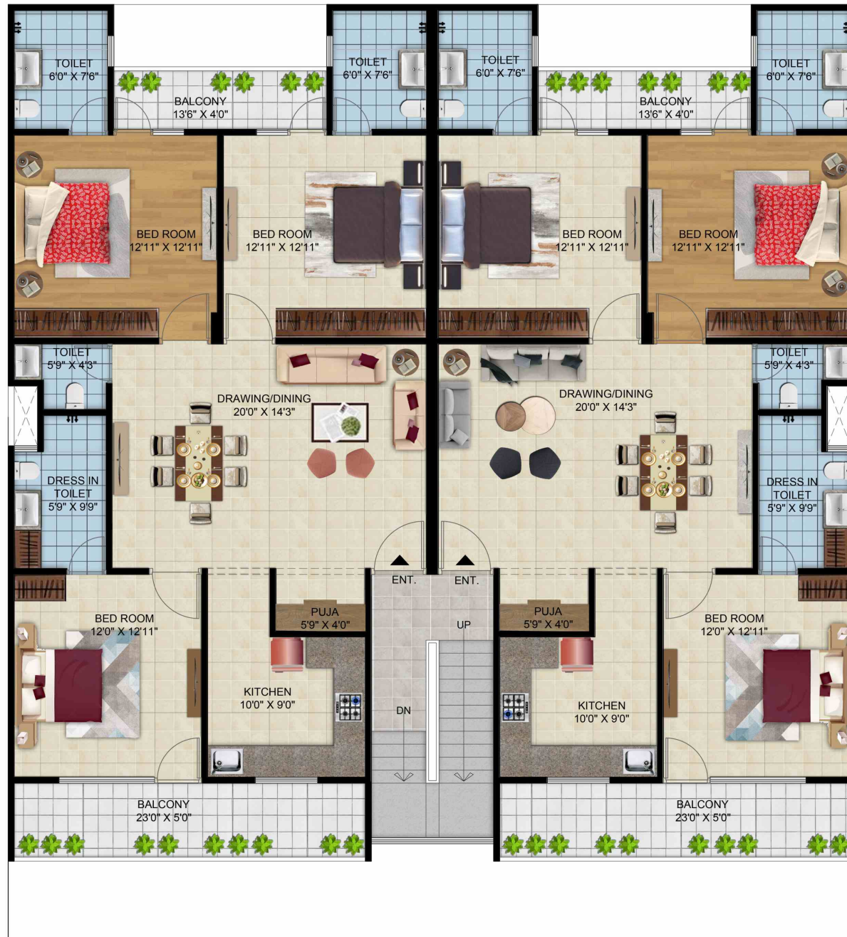
175 SQYD FLOOR PLAN - TYPE A