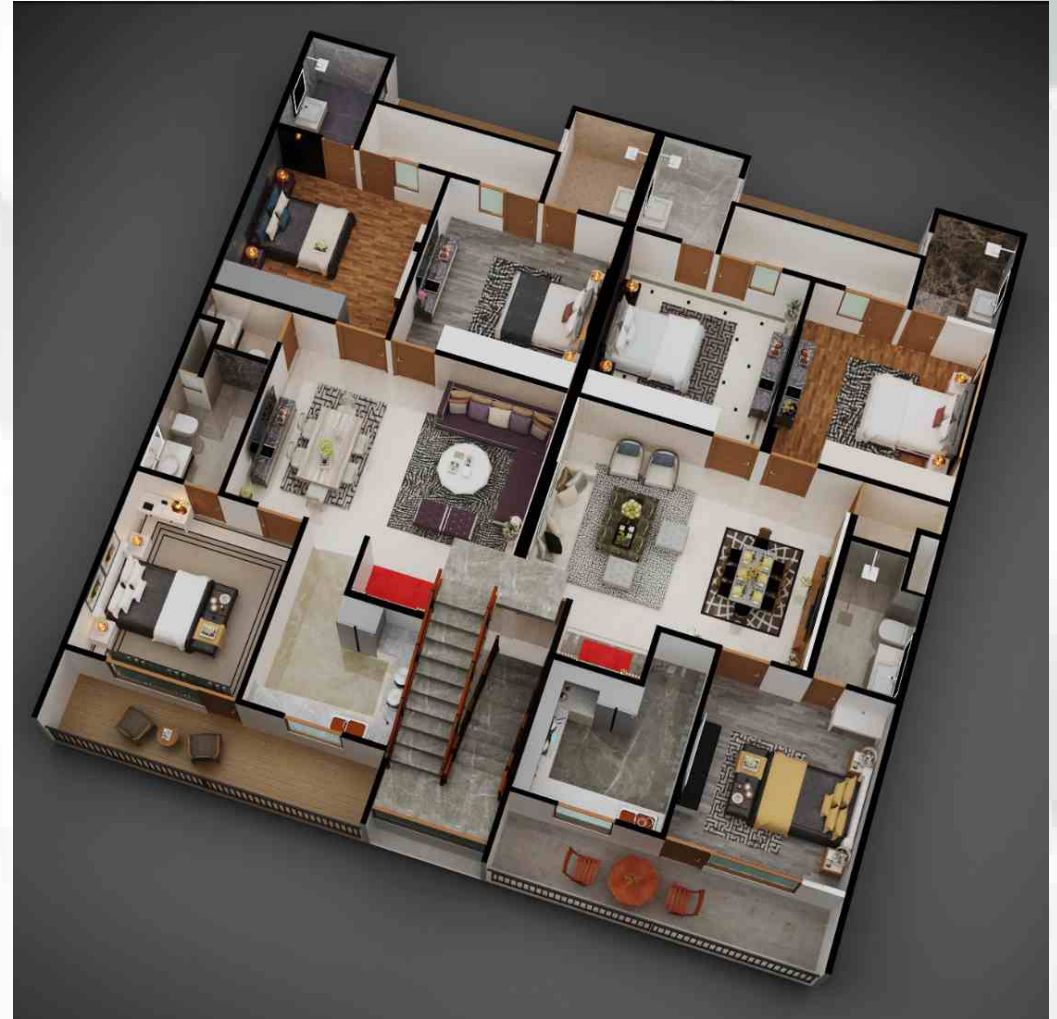
175 SQYD FLOOR PLAN - TYPE A